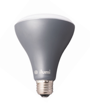
RGBW LED Flood Light Bulb Outdoor/Indoor Use (DS-RGBBR30OUT-A) BR30 Flood Light Bulb Bluetooth Compatible