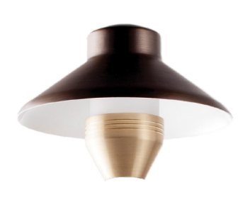
6" Brass Path/Area Hat (D6PTH-HAT) Weathered Brass

Weathered Brass (Bi-Pin Lamp & 12", 18", 24", 36" Stems Sold Separately)