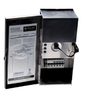
300W 12V Transformer (NTD-300WTRAN)

Stainless Steel, Fully Potted, Insulated, Single Core, Inline Surge Protection