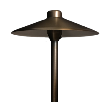
12" Area Light Hat (12AREA-HAT)

Die-Cast Path Light 18" Stem Included (Bi-Pin Sold Separately)