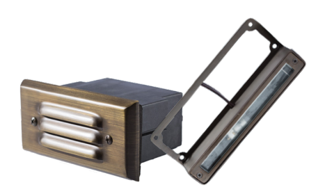
Lip & 5/8" Step (LIP-WB/ STEP5/ STEP8) Weathered Brass (Bi-Pin Lamp Sold Separately)