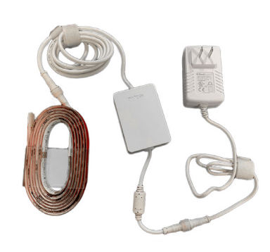
RGBW Strip Light Kit (DS-RGBSTRIPKIT-A) 6.6' of Light Strip, 30W Adapter, Controller, 24V Power Supply Bluetooth Compatible