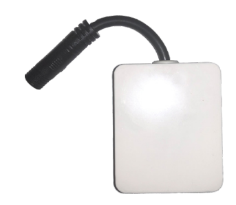
MeshTek BT Repeater (DS-REPEAT-NTD-AC)

Bluetooth and Wifi Compatible Gateway for RGB Smart Lights