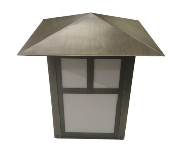
Aged Brass Post Light With Frosted Lens

Weathered Brass with Ground Stake Attached (Bi-Pin & Hats Sold Separately)