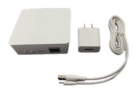
Wifi/Bluetooth Gateway Cloud Management (DS-GATEWAY)

Bluetooth and Wifi Compatible Gateway for RGB Smart Lights