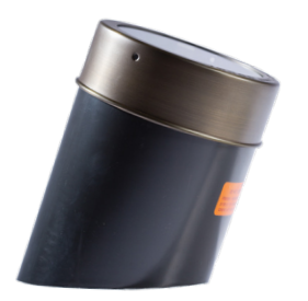
Inground LED Well Light