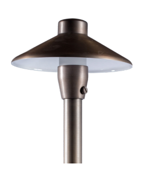
7" Path Light Hat

Weathered Brass (Bi-Pin Lamp & 12", 18", 24", 36" Stems Sold Separately)