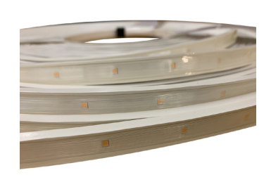
Strip Light (FLXLEDSTRIP)

Bi-Pin/MR16 Lamp (MR16 Lamp Sold Separately)