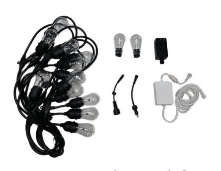
RGBW LED Bistro Lights (DS-RGBBISTRO24, DS-RGBBISTRO48) Suspender Light String with 24" Spacing, 12 Bulbs, 110V with Control Module Bluetooth Compatible (24" & 48" Extension Sold Separately)