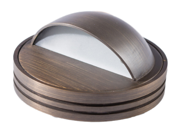
Cast Brass Eyelid (EYE-WB) Surface Mount Wall Sconce (Bi-Pin Lamp Sold Separately)