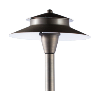
8.5" Two-Tiered Area Light Weathered Brass (8.5AREA-WB)

Weathered Brass (Bi-Pin Lamp & 12", 18", 24", 36" Stems Sold Separately)