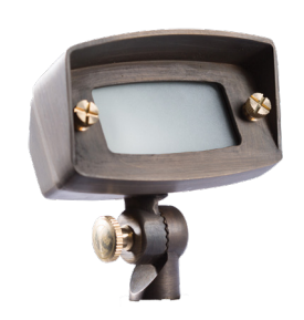
Cast Brass Mini Wash Light (MWASH-WB)

PVC Ground Stake with Brass Lock Ring (MR16 Lamp or Bi-Pin Sold Separately)