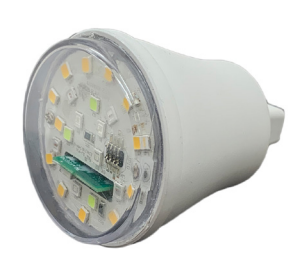
Smart RGBW LED MR16 Large (DS-RGBMR16LG-A) Bluetooth Compatible