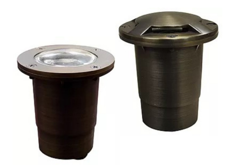
Recessed Brass Spot With Clear Convex Lens (RSPOT-150, RSPOT-170, RSPOT-180, RSPOT-360)

Recessed MR16 Spot Cast Brass with ABS Sleeve (MR16 Lamp Sold Separately)