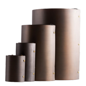
4/6/9/12" Wall Sconce (SCN4, SCN6, SCN9, SCN12) Weathered Brass Dual Sockets on 6", 9", & 12" (Bi-Pin Lamp Sold Separately)