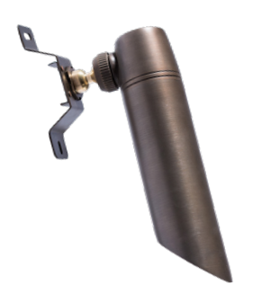
Cast Brass Tree Down Spot (TRSPOT-CB)

MR16 Weathered Brass Spot Light, PVC Ground Stake with Brass Lock Ring (MR16 Lamp Sold Separately)